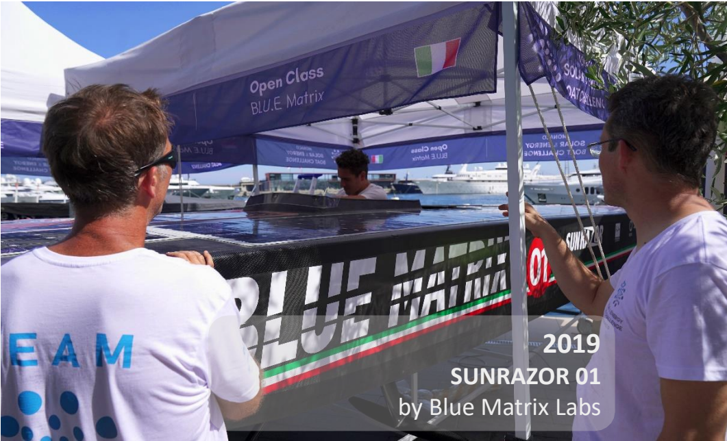
2019 SUNRAZOR 01 by Blue Matrix Labs