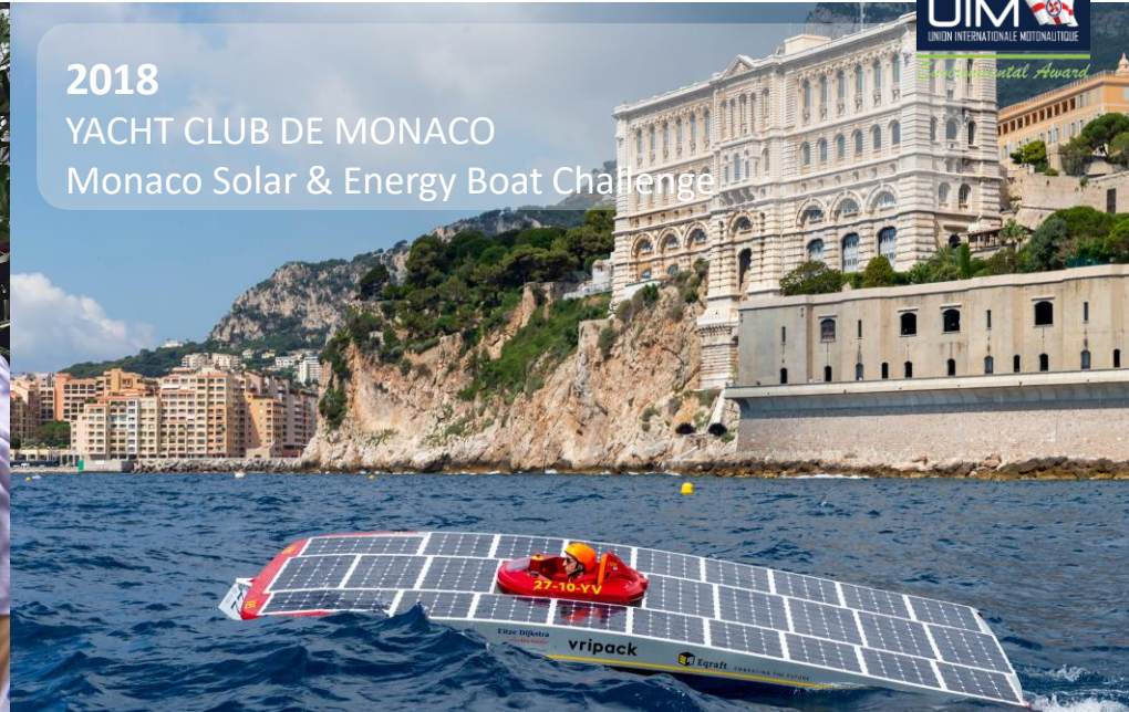
2018 YACHT CLUB DE MONACO Monaco Solar & Energy Boat Challenge